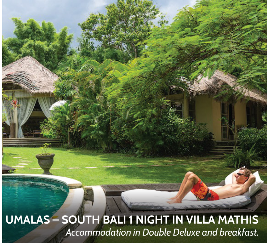
UMALAS – SOUTH BALI 1 NIGHT IN VILLA MATHIS Accommodation in Double Deluxe and breakfast.