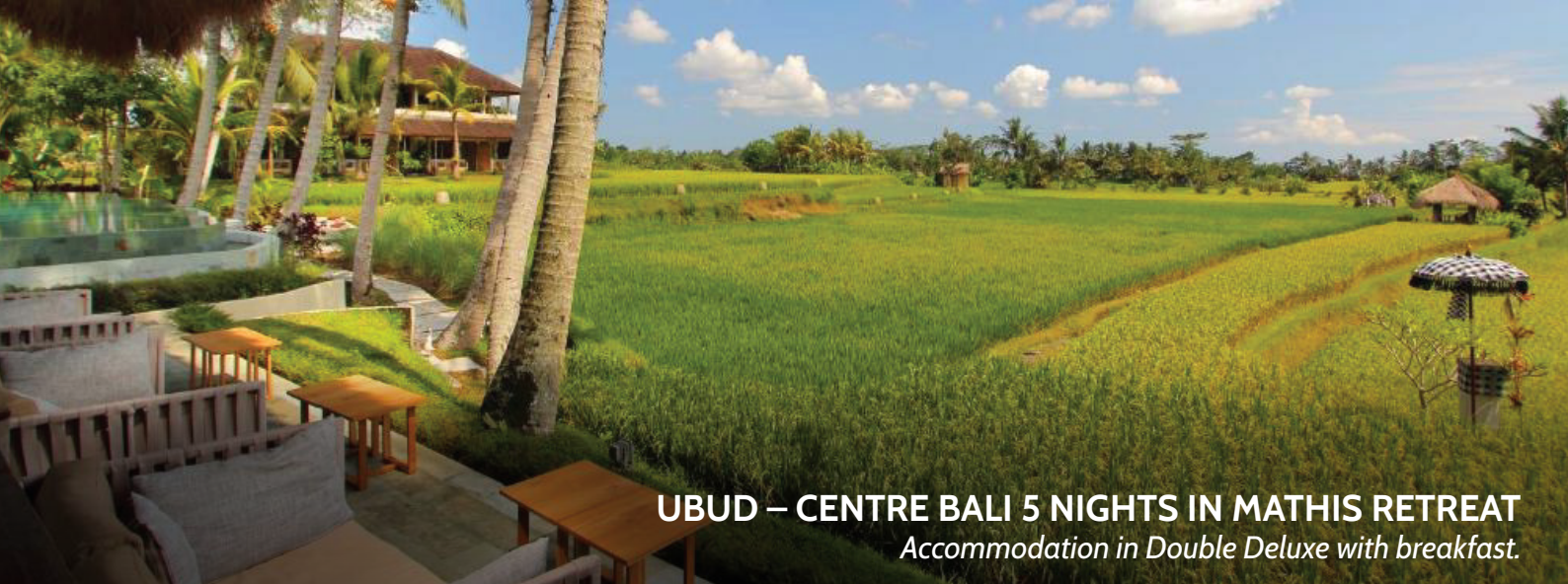
UBUD – CENTRE BALI 5 NIGHTS IN MATHIS RETREAT Accommodation in Double Deluxe with breakfast.