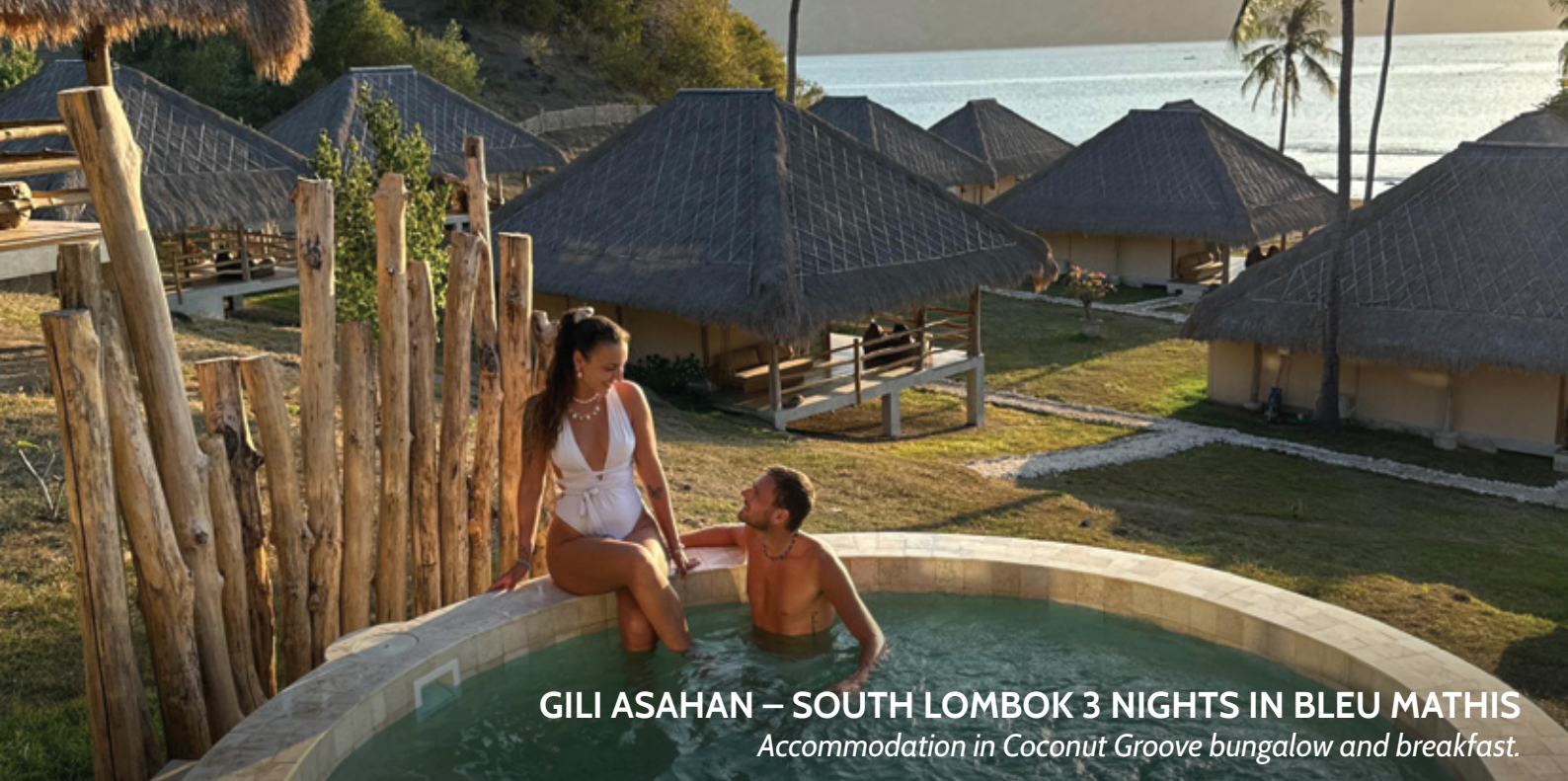
GILI ASAHAN – SOUTH LOMBOK 3 NIGHTS IN BLEU MATHIS Accommodation in Coconut Grove bungalow and breakfast.