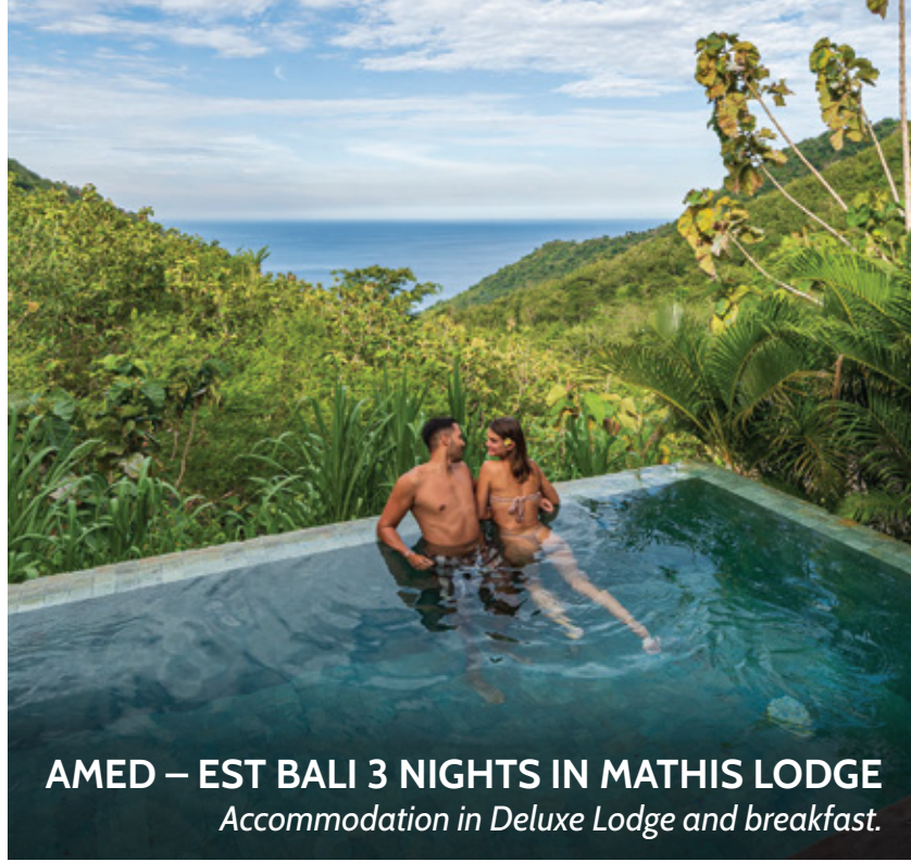
AMED – EST BALI 3 NIGHTS IN MATHIS LODGE Accommodation in Deluxe Lodge and breakfast.