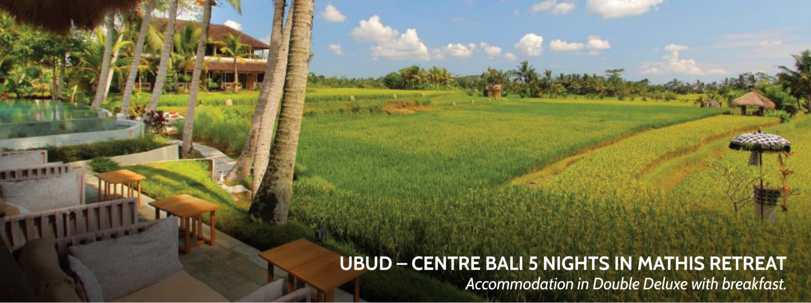
UBUD – CENTRE BALI 5 NIGHTS IN MATHIS RETREAT Accommodation in Double Deluxe with breakfast.