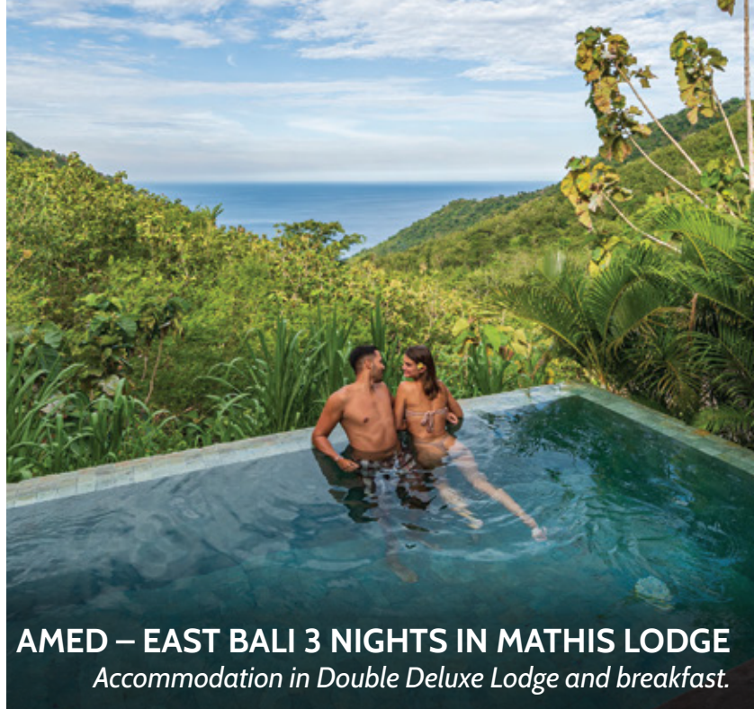
AMED – EAST BALI 3 NIGHTS IN MATHIS LODGE Accommodation in Double Deluxe Lodge and breakfast.